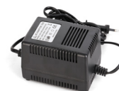
AC24V/3A Power Adapter